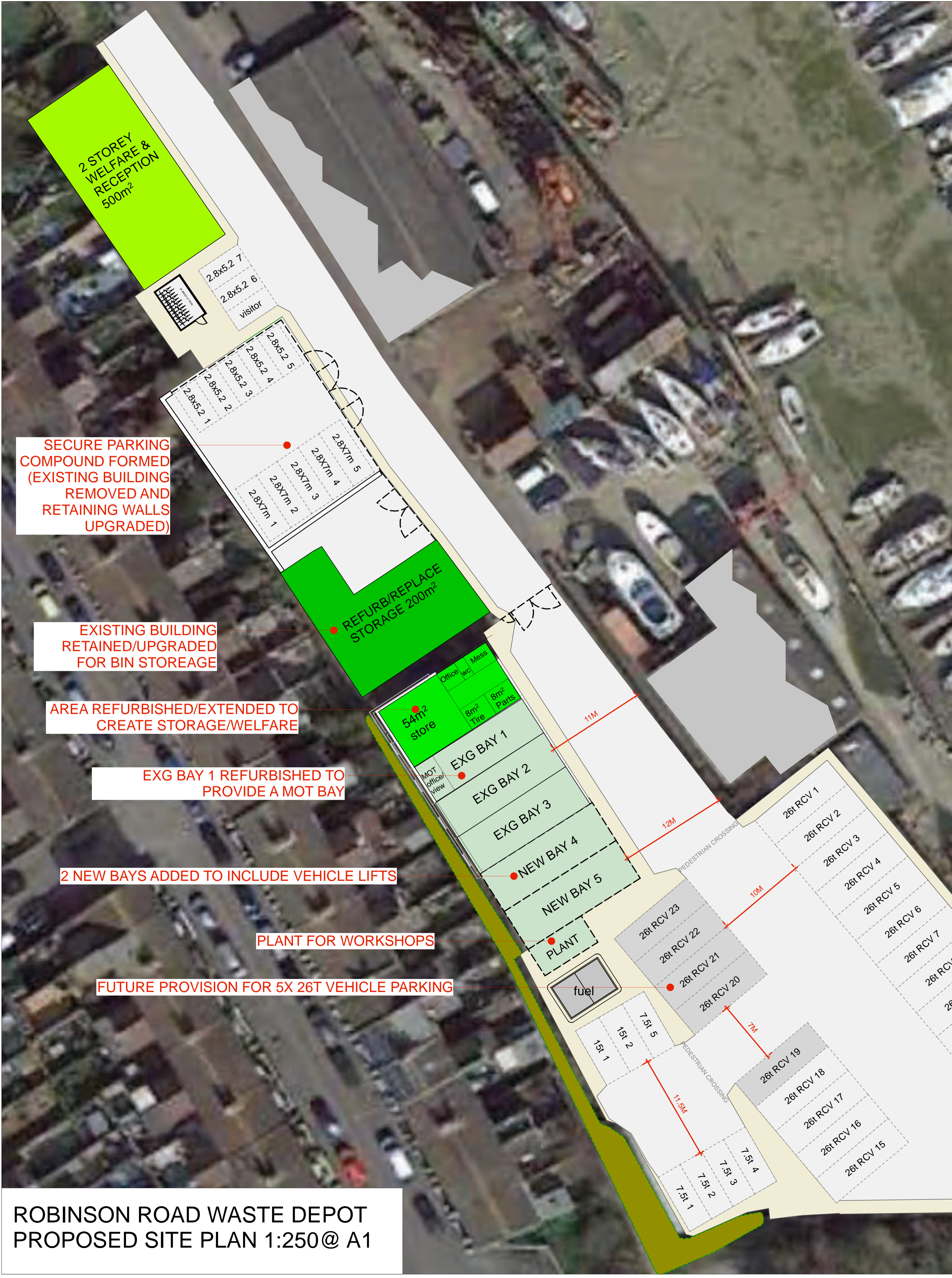
ROBINSON ROAD WASTE DEPOT PROPOSED SITE PLAN 1:250@ A1